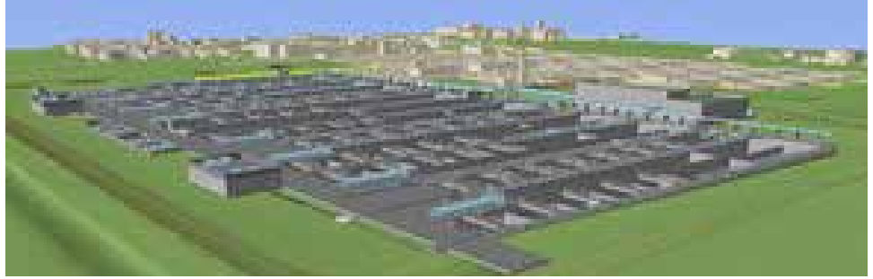
The plant upgrade, to be completed by 2023, will also include new granular media filtration and enhanced disinfection.