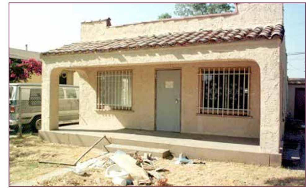
Los Angeles is accusing big banks of predatory lending in its minority communities. But the city has more failures than successes.

In their complaint, the city attorney's office alleges that JP Morgan pursued communities of color for abusive subprime lending – even if the borrowers qualified for regular prime-rate loans – before the housing bubble collapsed.